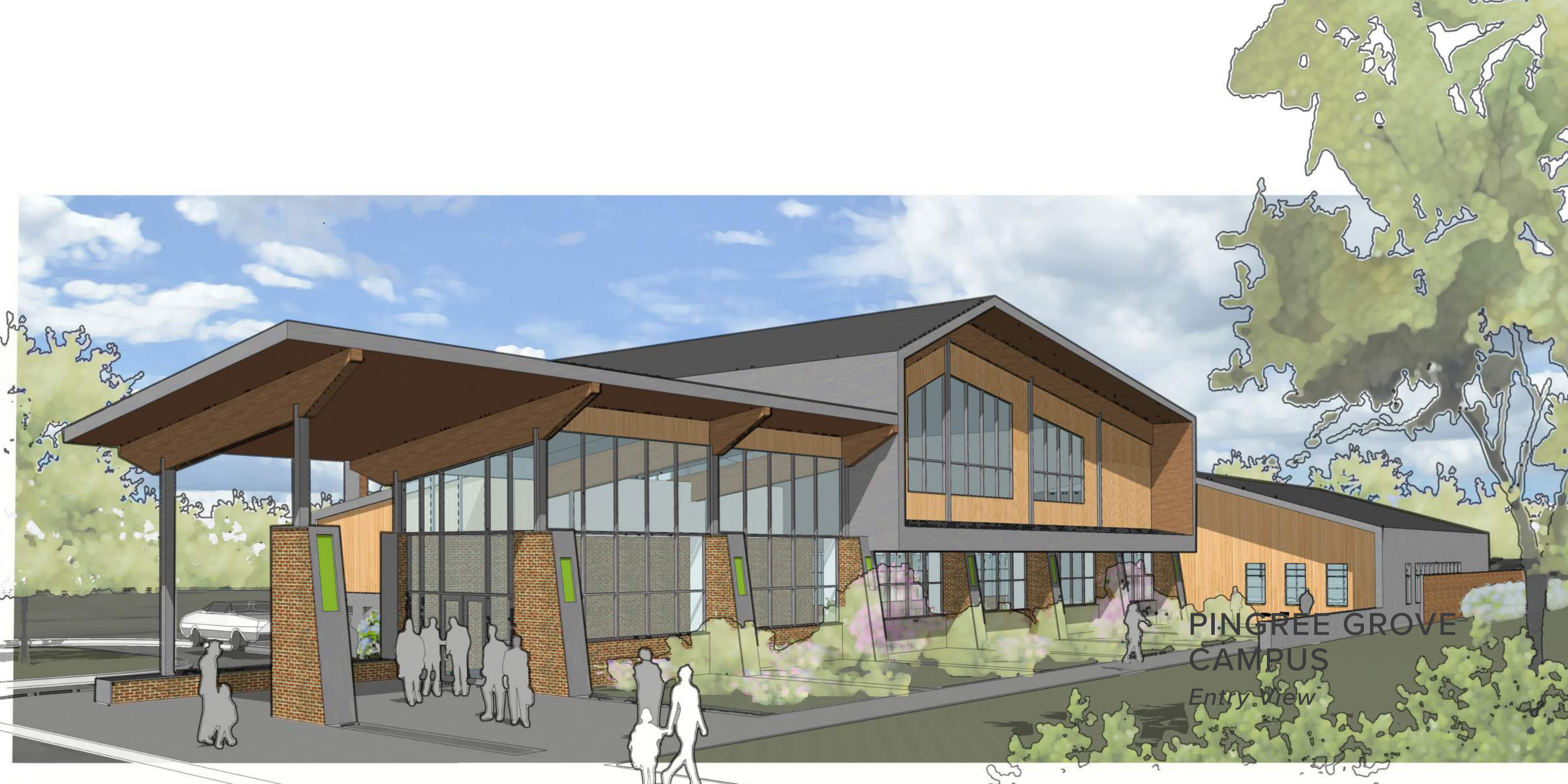
PINGREE GROVE CAMPUS Entry View