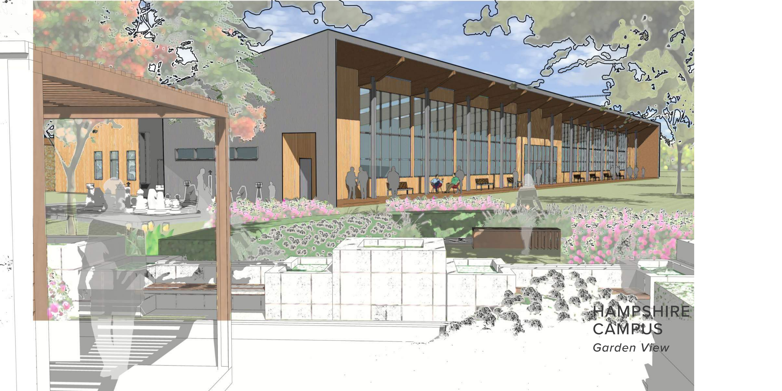
HAMPSHIRE CAMPUS Garden View