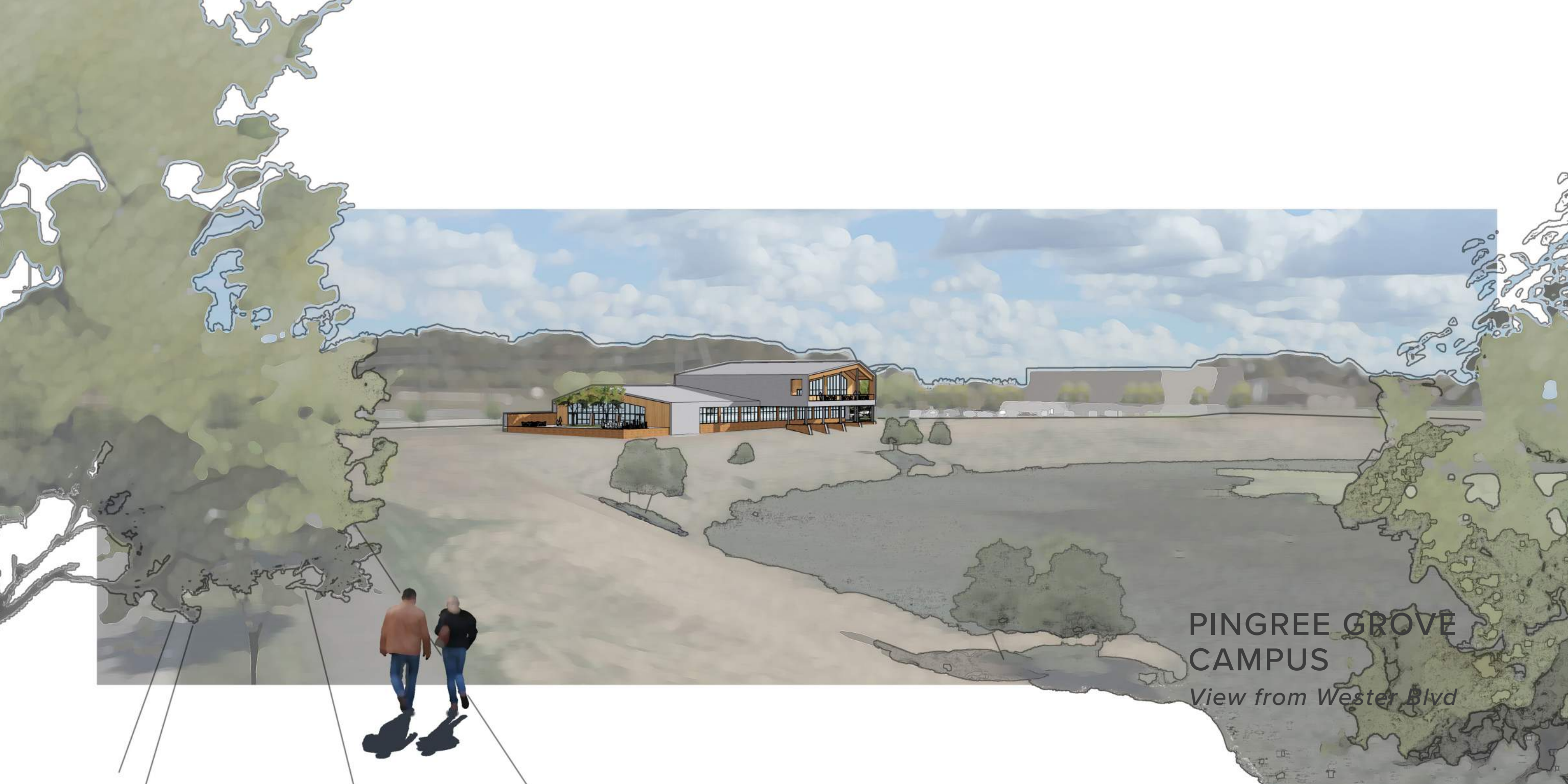
PINGREE GROVE CAMPUS View from Wester Blvd